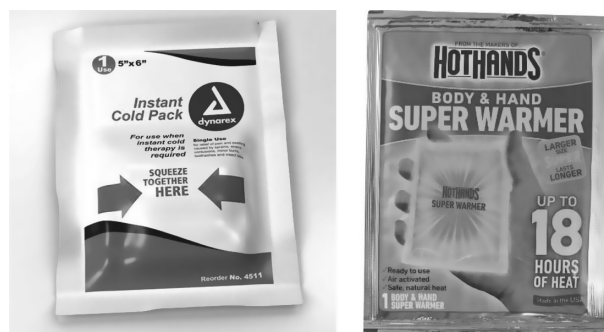
Figure 1. Example of therapeutic packs used in the study. Both packs were 4" × 5" size.

Once participants completed these questions, the questionnaire directed them to place the therapeutic gel pack